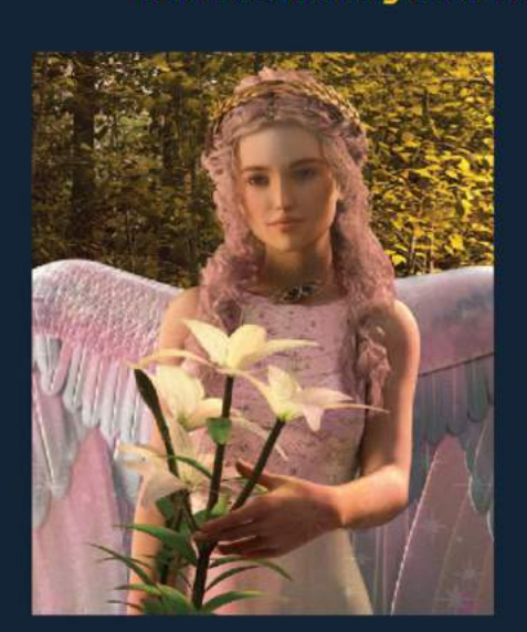
24 original color images of angels by David Keil.